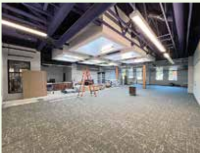
Library Resource Room

The school’s new spaces will enable scholars to collaborate, innovate, and engage in deep learning. We’re excited to bring a renewed sense of pride to Illahee scholars through their new and improved campus!