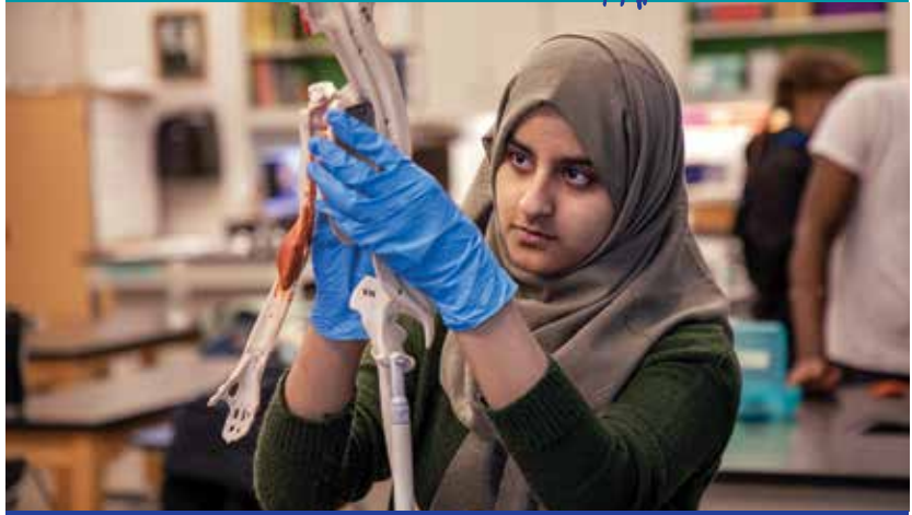
A Federal Way High School student in the Human Body Systems class adds clay muscles, bones, and cartilage to a skeleton model.