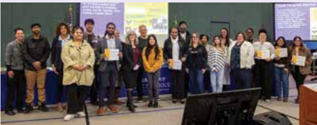
This list reflects donations received as of January 14, 2025