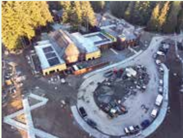
Bus loop and ADA ramp

ILLAHEE MIDDLE SCHOOL is the last of eight school construction projects approved by the 2017 school construction bond, and we are excited to share that the school is near completion with just a few months of work left to go! The building team is now in the final phase—adding finishes to the expansive campus. As you may know, Illahee’s main building has been completely rebuilt while the gym facilities were gutted then completely remodeled.