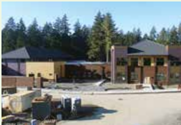
Main building exterior