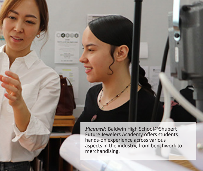
Pictured: Baldwin High School@Shubert Future Jewelers Academy offers students hands-on experience across various aspects in the industry, from benchwork to merchandising.