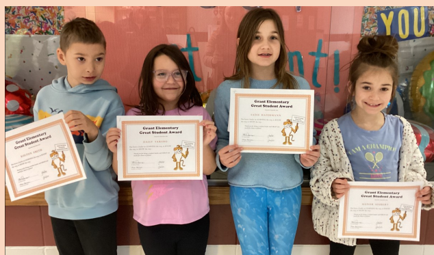
Absent day of awards