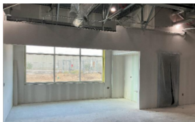
Pre-K/Kinder classroom additions and renovations are on track at Highland Forest Elementary (left) and Oak Crest Elementary.