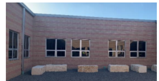
Outdoor courtyard at Heritage Middle School.

Highland Forest Elementary has had improvements to the parent pick-up process, upgraded flooring in corridors, and enhanced technology throughout the campus.