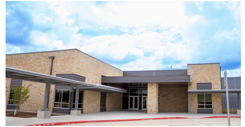
Honor Elementary opened on time for the 2024-2025 school year.

Thank you to our community for your support in helping us shape a brighter future for East Central ISD!