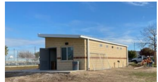
Concessions and restrooms at Legacy Middle School.

Progress is underway for the new Career and Technical Education (CTE) Multipurpose Facility, with a clear timeline established. While we await final permits to begin construction, preparations are being finalized to ensure a smooth start to this exciting project. Move in is scheduled for January 2026.