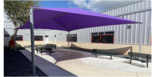
Outdoor courtyard at Legacy Middle School.

Outdoor collaborative spaces have been completed at Legacy Middle School and Heritage Middle School, providing students and staff with dynamic environments for learning, teamwork, and creativity. These spaces are designed to inspire collaboration and enrich the overall educational experience, offering flexible areas for both academic and recreational activities.