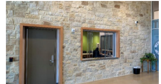
Security vestibule is complete at Tradition Elementary.