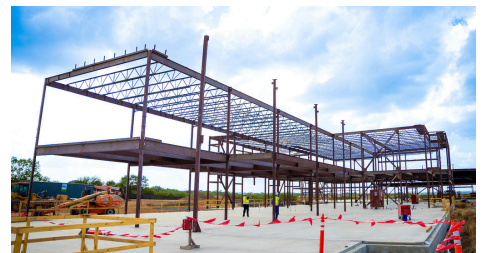
Valor Middle School is on schedule to open in the fall of 2026.

Valor Middle School reached a significant milestone with a beam-signing ceremony at its construction site in St. Hedwig. Scheduled to open in the fall of 2026, the new school will provide innovative learning spaces to serve our District's middle school students.