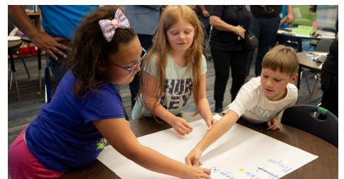
The second elementary school, named Victory Elementary, is scheduled to open in the fall of 2026.