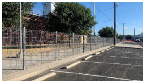
New perimeter fencing has been installed at East Central High School.