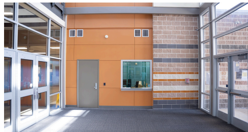
Security vestibule is complete at East Central High School.

At Oak Crest Elementary, the parent pick-up process has been improved, flooring in the corridors and cafeteria has been upgraded, and new technology enhancements have been implemented.