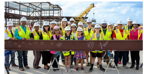
There was a beam signing ceremony for Valor Middle School on Oct. 29, 2024.