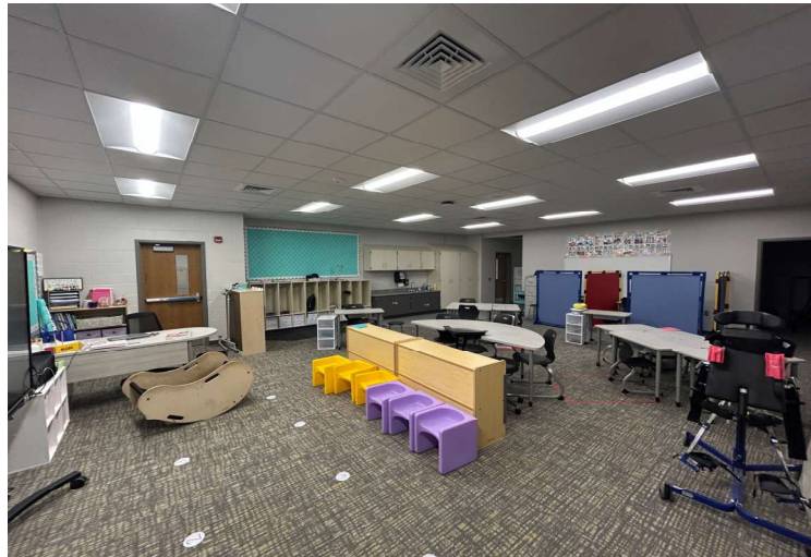
Applied Skills Room