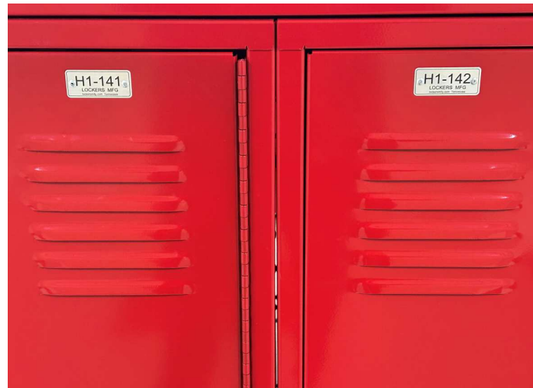
Number Plates for New Lockers