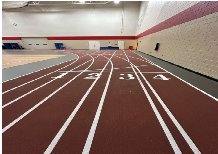
Repainted Fieldhouse Track Lines