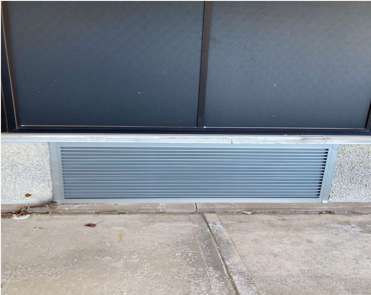
New Louvers in Courtyard