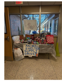
5th Grade Citizenship Project