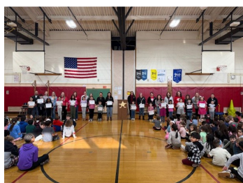
December Student of the Month- Most Improved