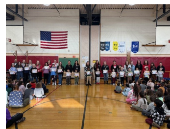
December Student of the Month- Cooperation