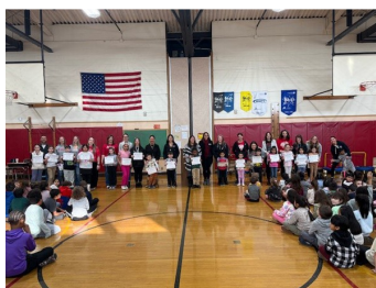
November Student of the Month- Most Improved