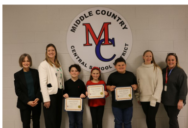
5th Grade Student of the Month - Board of Ed. Meeting