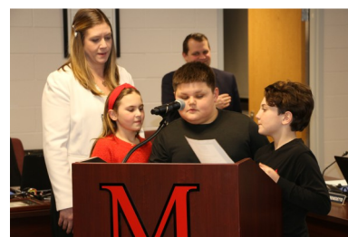
5th Grade Student of the Month Pledge of Allegiance at Board of Education Meeting