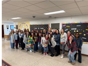
Teachers- 90th Day of School!

We celebrated the 90th Day of school as a staff... Don't forget our Founder's Day will be a Throwback to the 90's with the PTA