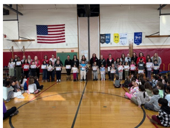
November Students of the Month- Citizenship