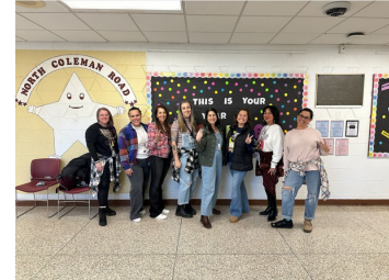
Pre-K 90th Day of School

We celebrated the 90th Day of school as a staff... Don't forget our Founder's Day will be a Throwback to the 90's with the PTA