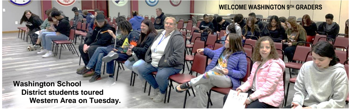
Washington School District students toured Western Area on Tuesday.