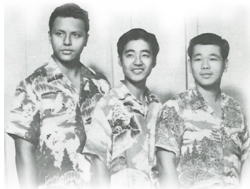
HBA's first graduating class in 1954