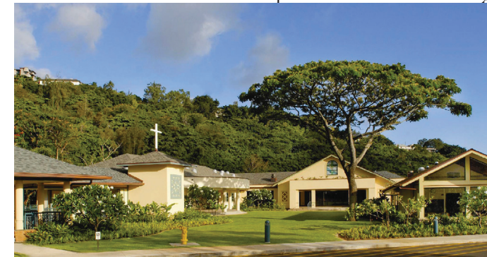
Dan Kong Middle School Campus