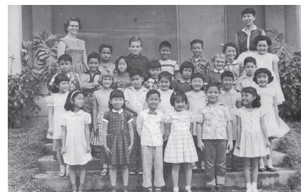
2nd grade class - 1957