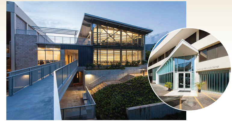
New Arts and Science Building and the Learning Resource Center (inset).