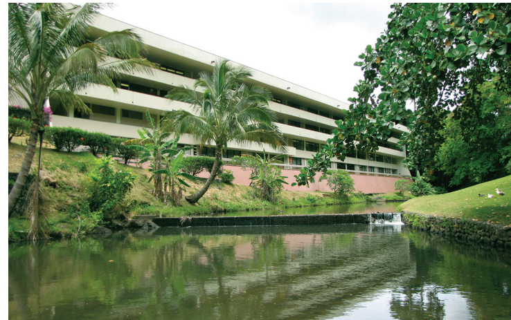
The Bessie Fleming Building - Pali Campus