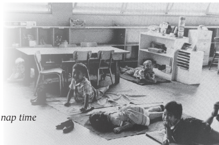
Kindergarten nap time