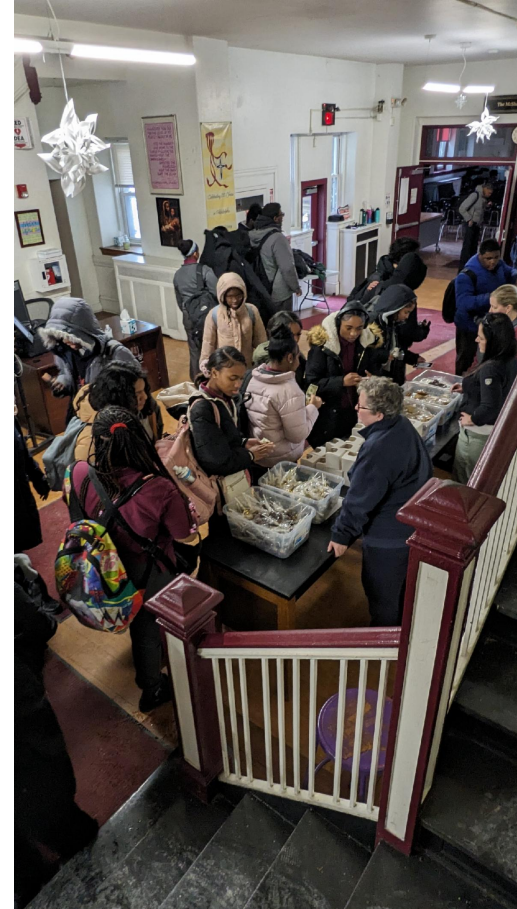
The Mercy school community held a bake sale with proceeds benefiting the victims of the Southern California fires.