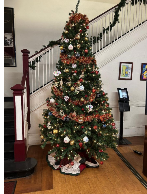
Students spread Christmas cheer during our Deck the Halls of Mercy event.

Wishing you a joy-filled Holiday Season and a Happy New Year!