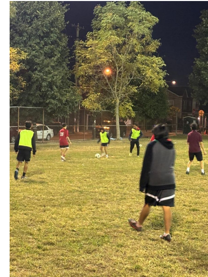
The soccer team helped local elementary school students practice their skills.