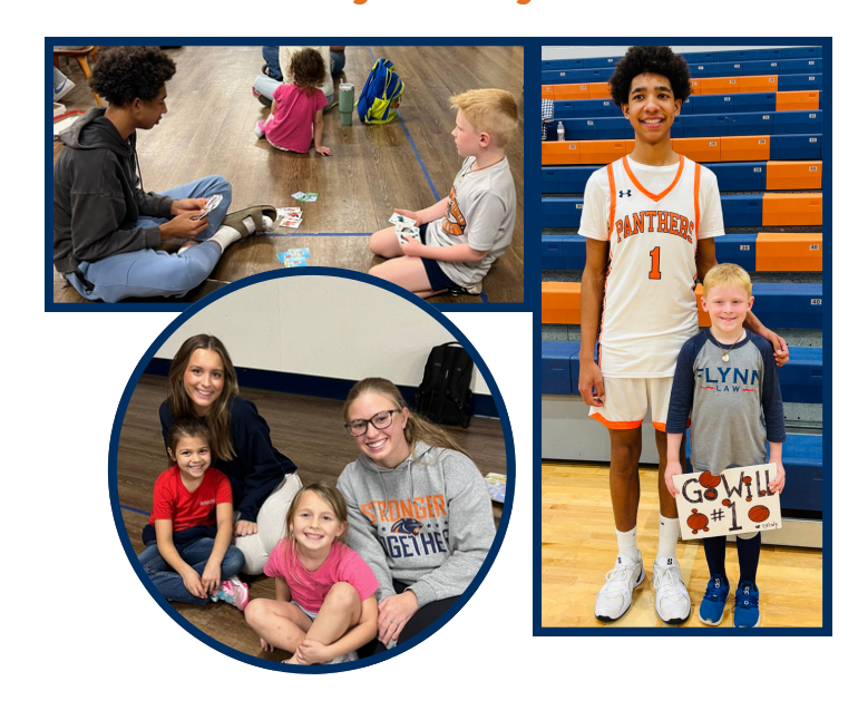
Dress Down Day: Sports theme