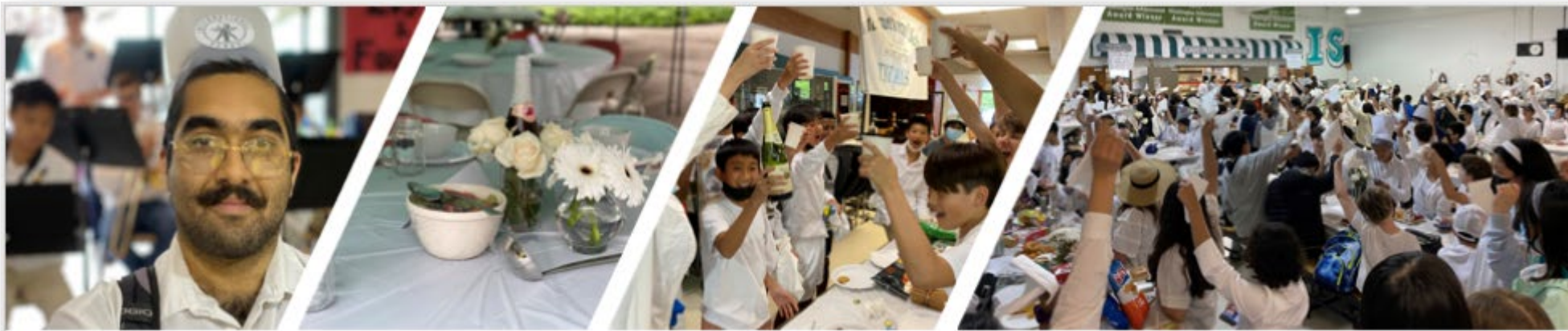
Déjeuner en Blanc