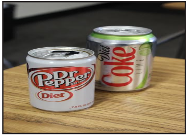
Is diet soda worth it? page 3