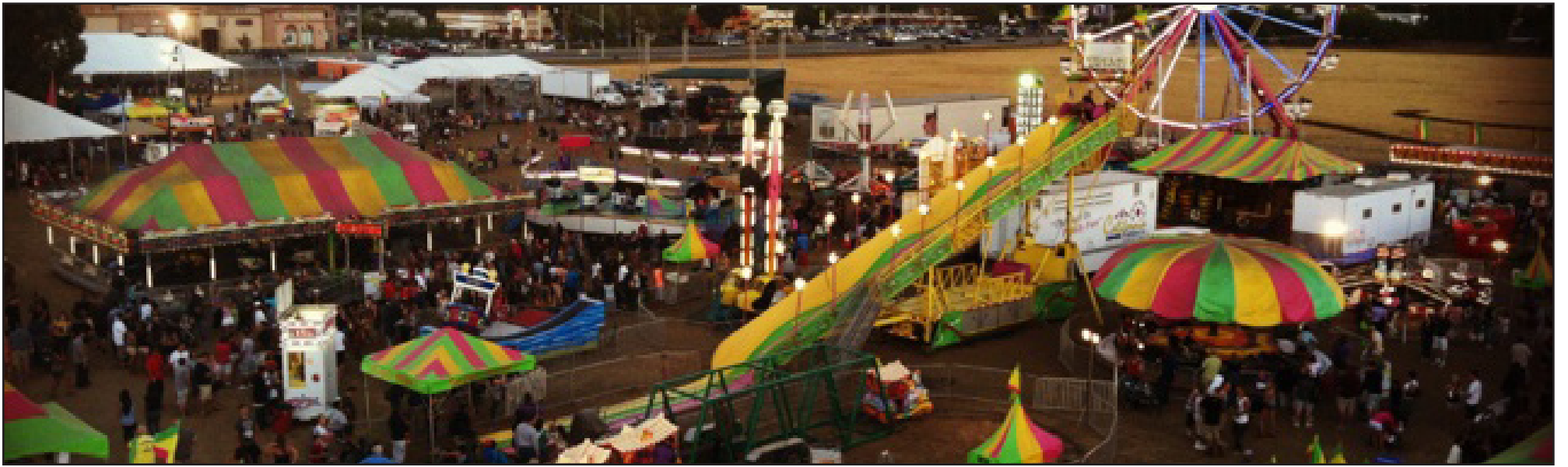
Families of all sizes loved the rides and Kids Zone at Cornfest, which was cancelled both last year and this year so far.