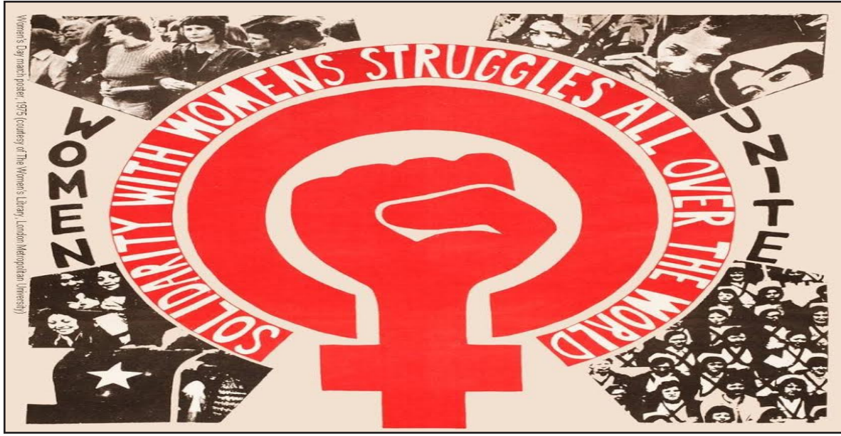
Women from all over the world stand up for feminism.