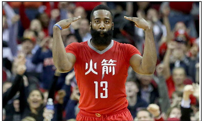
Houston Rockets star James Harden looks for his first NBA championship in 2015