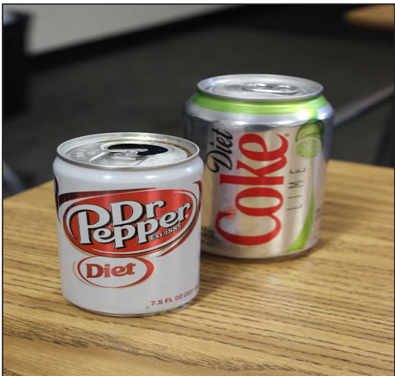
Is this the way to lose those extra five pounds? Studies say the answer is no.