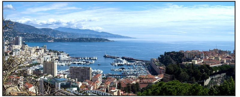
Monaco is the second smallest country in the world, most known for hosting various car race championships and for its status as a constitutional monarchy.