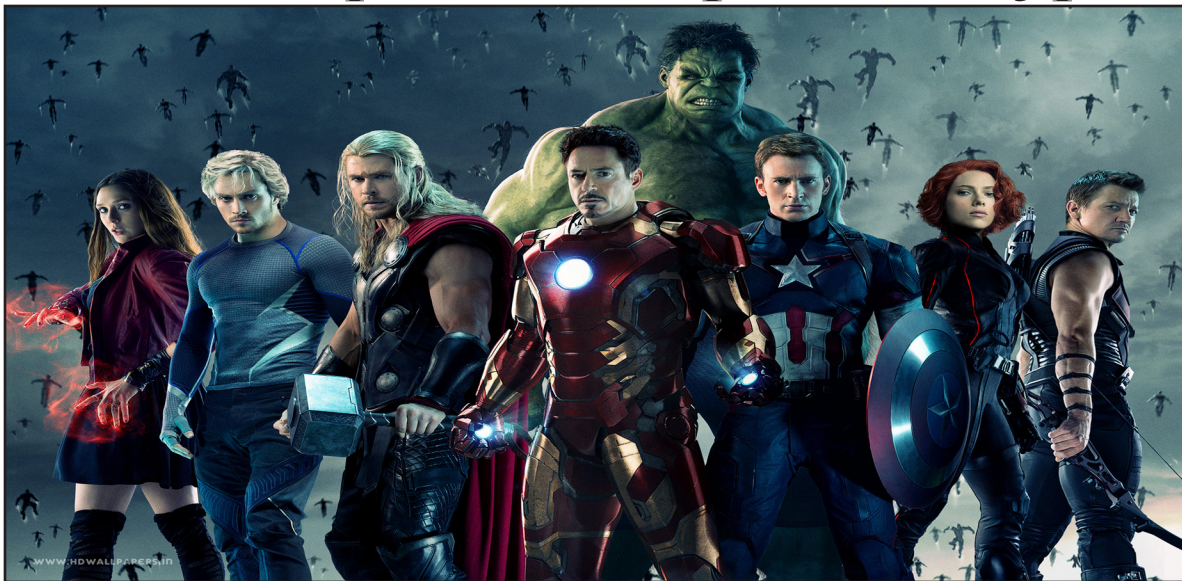
The cast of Avengers: Age of Ultron .