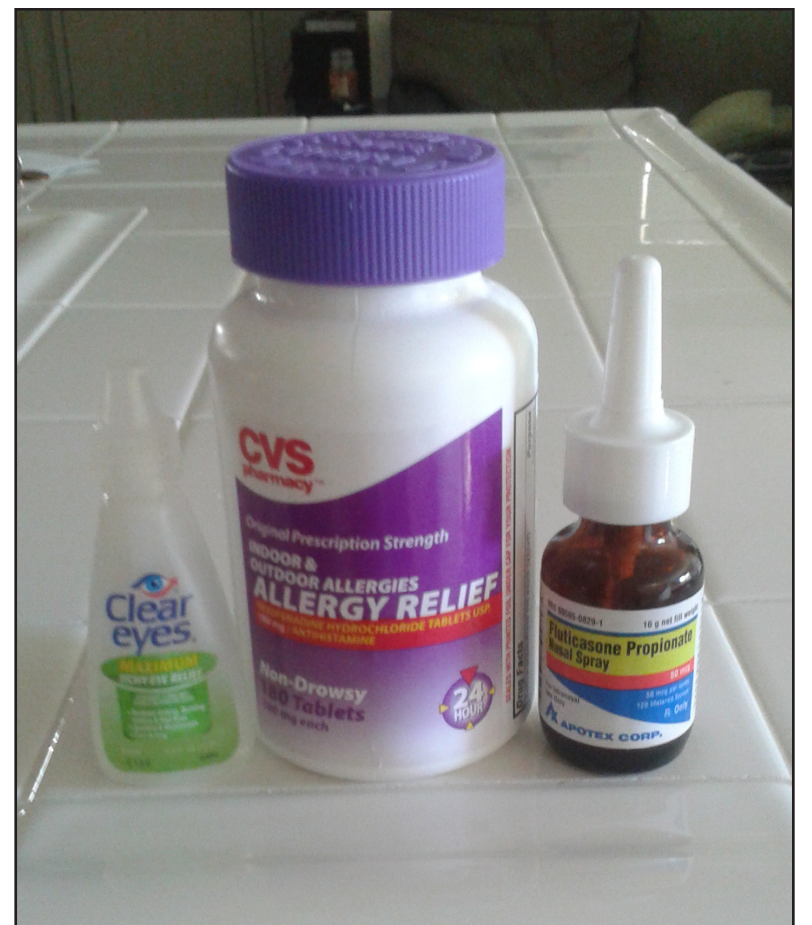
Some over the counter medications can help fight allergy symptoms.