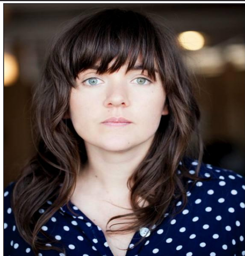
Picture of the talented singer Courtney Barnett.