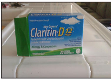
Coping with allergies, page 2