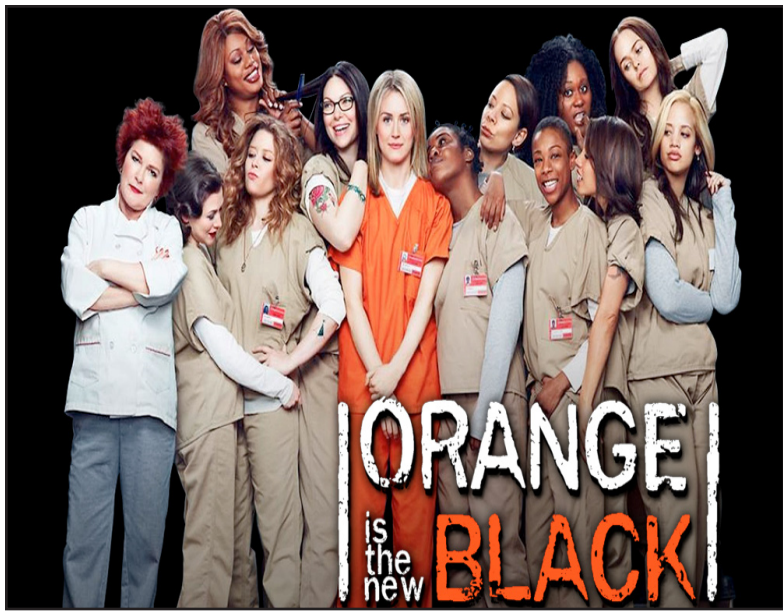
Orange is the New Black is an original series on Netflix.