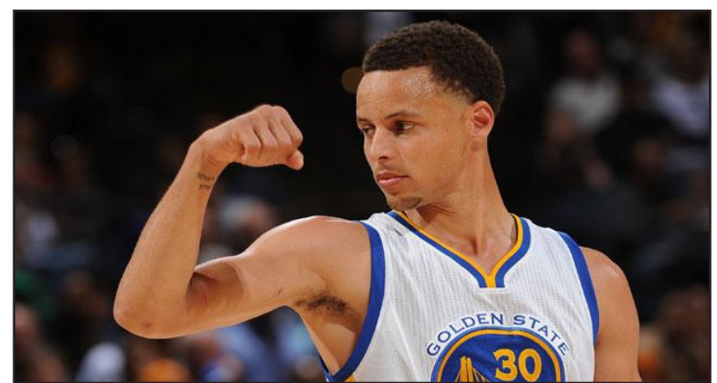
Steph Curry looks to cap off an electrifying year with an NBA title.

pers' Chris Paul, the Hawks' Jeff Teague, and the hometown favorite Steph Curry to step up and claim the championship. Their electrifying style of play excites fans, and ensures even casual fans whose teams are not in the finals will tune in. This would offer a major boost to NBA ratings, as well as help shape the future of the league. This year could perhaps end the dominance of established teams like the Spurs and Lakers, start a new one of high scores such as James Harden and Blake Griffin. The league never has a shortage of young stars, and maybe now they will produce more NBA championships than ever before. The only thing left is for these young, gifted stars to step up and grab the spotlight.