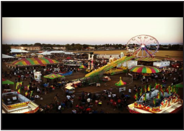
Fate of the Cornfest, page 2