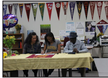
College signing, page 5