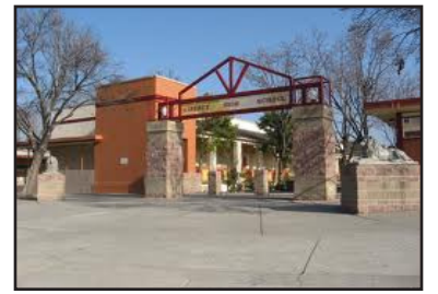
Campus safety, page 8

The voice of Liberty High School students