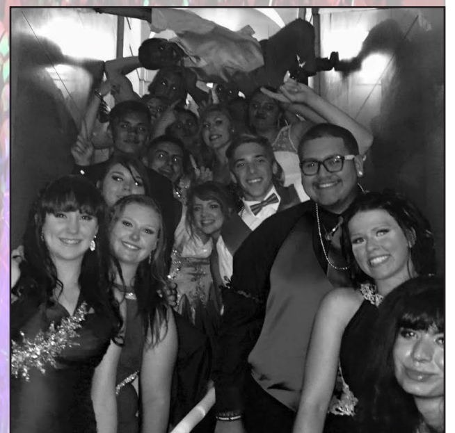
PADA students in the stairwell at the Bentley Reserve

An evening of elegance at the Bentley Reserve in San Francisco