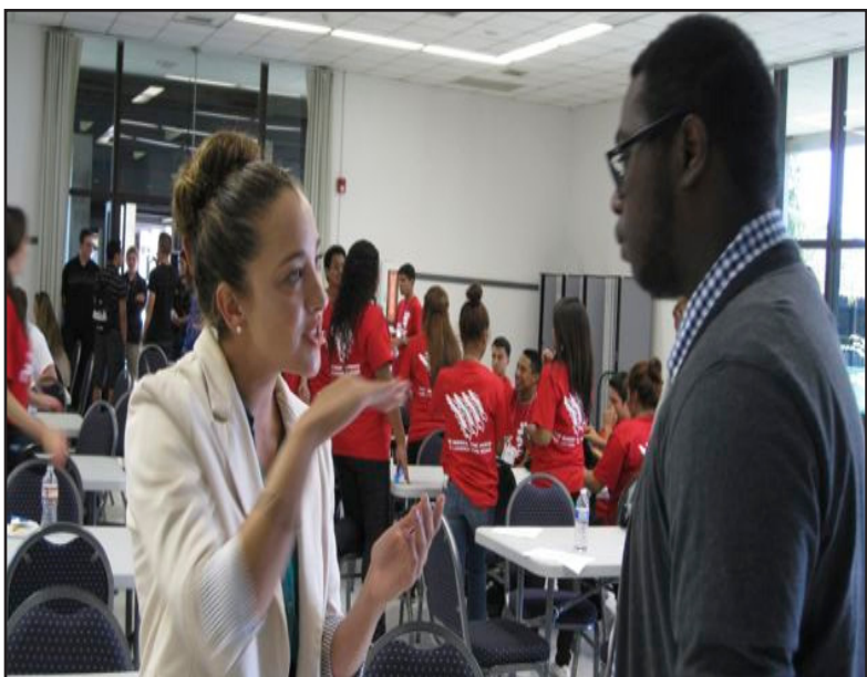
Virtual Enterprise Holds Fall Kick-Off for local high school entrepreneurs