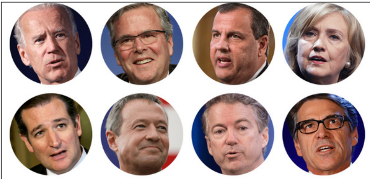
Many want to be the 45th president. Only one will succeed.

Rev up your DVRs and tape up your mailbox, the 2016 elections are rapidly approaching us. This election, so far it seems like there is a wide range of candidates from all across the spectrum, from Jeb Bush to Hillary Clinton, Rand Paul to Bernie Sanders, and much, much more. With all of these names out there, however, one has to wonder where they stand and who could best represent America. Hilary Clinton, who was Bill Clinton's first lady from 1993 to 2001, is a woman's rights activist and, if elected, the US's first female president. She headed the Task Force on National Health Care Reform during her husband's presidency, but the group didn't produce anything beyond a complicated plan that was abandoned on September 1994. Jeb Bush, son of George H. W. Bush and brother of George W. Bush, became governor of Florida in 1998 until 2007 and started considering presidency in December 2014. He is known for