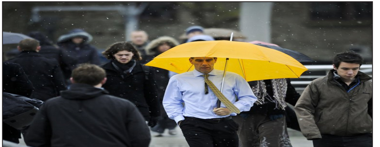
Seasonal affective disorder causes millions of Americans each year to enter a depressive state during the winter months.

About 4 to 6 percent of people may have a less hindering form of SAD, while another 10 to 20 percent of people may have a more mild form of the disorder according to the American Family Physician. SAD usually only affects people after the age of 20, and rarely before that, but there have been a large amount of documented cases.