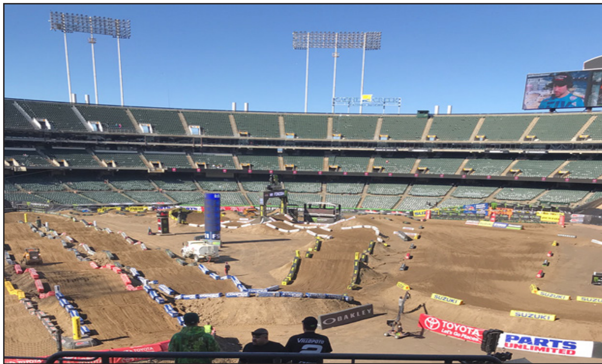
A trail of obstacles at Oakland Supercross on February 3rd, 2018, is prepped and ready to throw excitement to the crowd.

Braapppp! That's the sound of 20 or more motorcycles carving through the dirt. Supercross racing involves off-road motorcycles on a man-made dirt track consisting of large jumps and obstacles including two classes: 250cc and 450cc. The “250cc” and “450cc” are the sizes of the engines on the different motorcycles. The 450cc motorcycles are much faster, and the more experienced rider's rep the 450cc motorcycles. The tracks usually take place inside a sports stadium. The first supercross race held on a track inside of a stadium took place on August 28, 1948, at Buffalo Stadium in Montrouge. The racers of these events are participate because of their passion for extreme sports. These riders must practice and train daily to become the best racer on the track. Before