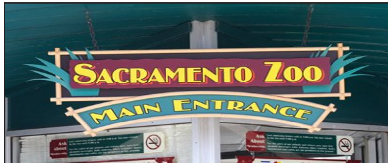
The Sacramento Zoo is one of the many destinations people can visit with the Discover & Go program.

with a county library card. Once on the website, the options can be organized by date or venue. The discounts vary from free passes for two to discounted family passes, to discounted age passes. Some options even offer a gift shop coupon along with venue passes, but quite a few passes come with certain restrictions regarding when and who. Venue selections contain a wide variety of cities and places: an Asian Art Museum in San Francisco, The Ruth Bancroft Garden in Walnut Creek, Powerhouse Science Center in Sacramento, even the Sacramento Zoo. So if you're looking for a fun spring break on a budget, consider looking into the Discover & Go program.