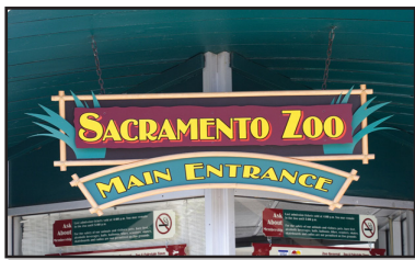
Spring break fun, Page 3