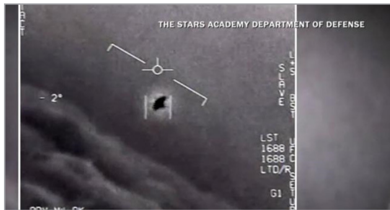
A clip from the AATI program displays an unknown object in the sky, something many could assert that it is an UFO.