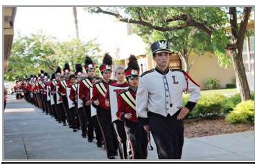
No band director, Page 2