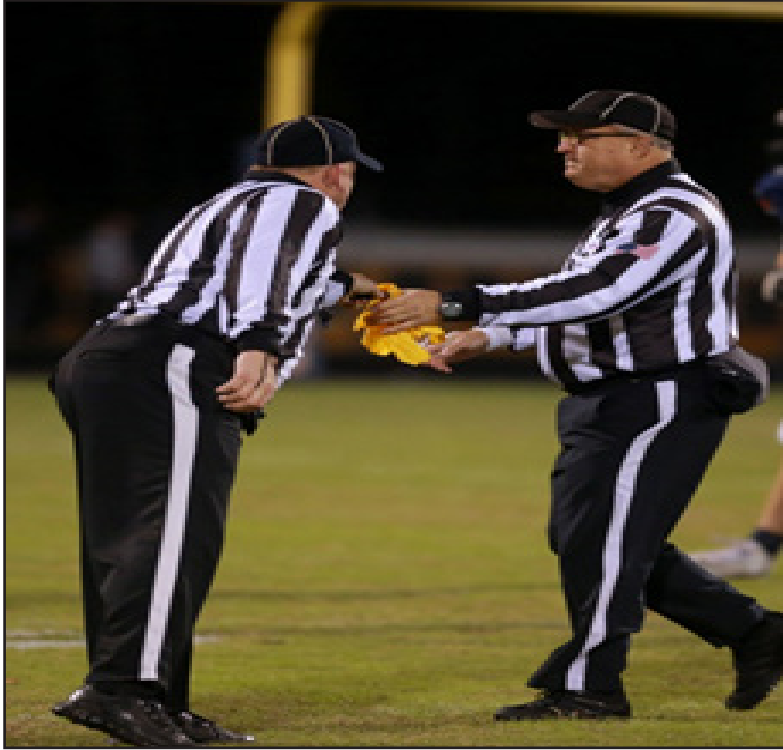
Two professional referees have most likely undergone sport-specific referee training to hold their position.

When applying, the whole process is online and people fill out an application; nearly a month after applying one will find out if he or she has been accepted or rejected. If accepted, people will be in a classroom, and will