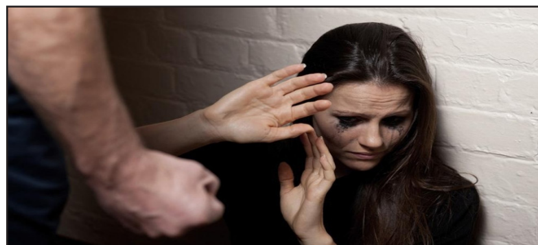
One third of domestic abuse victims will never leave their abuser.

two-income, or two-parent, households. Abusive households deliver a drastic pile of side effects on students as well. "The behavioral responses of children who witness domestic violence may include acting out, withdrawal, or anxiousness to please," states an article written by the Domestic Violence Round Table, where they also theorize that children who are affected by domestic violence or abusive households often carry their abusive behavior onto their children, creating an endless and disturbing cycle of abuse and violence. If you or someone you know needs child witness to violence information, please see your school counselor for more information.