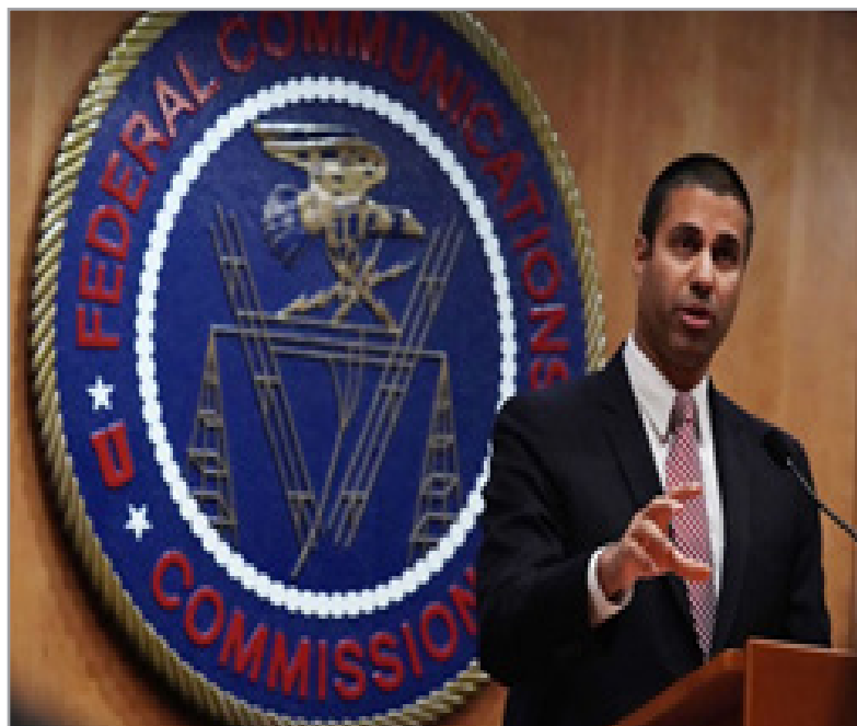
Pai, Clyburn, O'Reilly, Carr, and Rosenworcel of the Federal Communications Commission voted 3-2 along party lines to repeal Net Neutrality. This undid an Obama-era first established in the United States in early 2015.

How FCC's new decision on disabling Net Neutrality will affect students