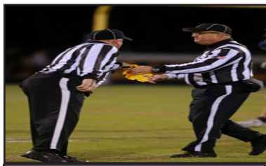
Want to be a ref? Page 6