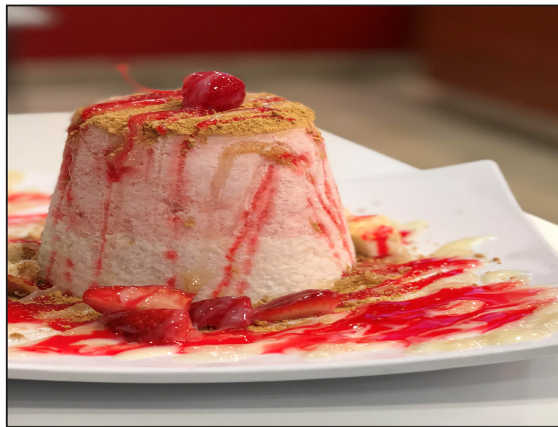
Vampire Penguin's delicious deluxe strawberry cheesecake is a big hit.

Although their menu may be a bit pricey to some, I believe it's definitely worth it if you're looking for a great place to dine in for a snack or dessert.