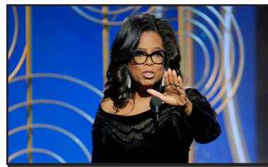
Celebs for President? Page 8

2nd Place award-winner from the American Scholastic Press Association