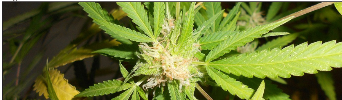
Start desensitizing yourself to the concept of this substance now, your neighbors can own up to six plants at a time.