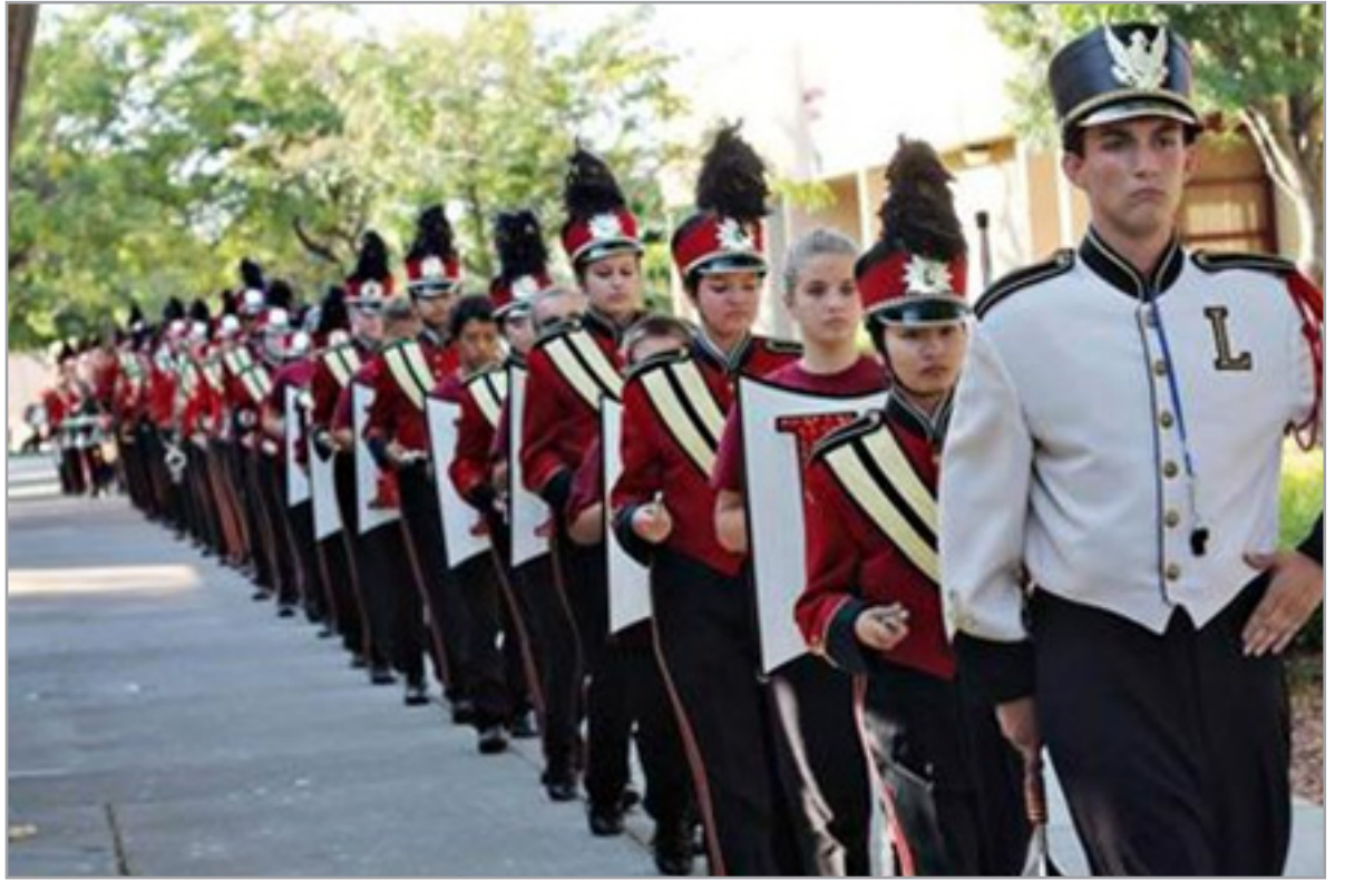
The Marching Band is visibly uniformed both in their clothing and within their music, but it is questionable if that will continue to hold true without a consistent band instructor.