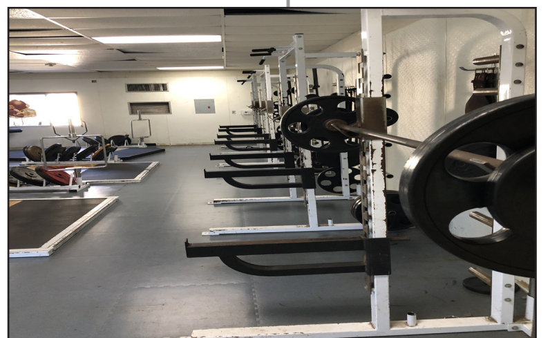
A glimpse into Liberty's weight room, where Liberty basketball teams strength train for their sports season.

The Liberty freshmen boys basketball team will continue to train hard to ensure Liberty's future varsity basketball team will be strong as can be.