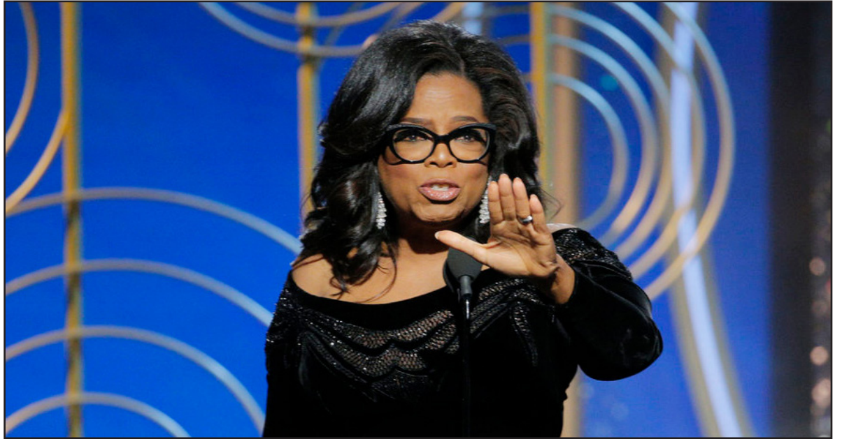
Taking a stand for the #metoo movement. Oprah Winfrey delivers her much talked about Golden Globes acceptance speech.

sure if either of them [referring to Oprah Winfrey and Kanye West] have prior political experience so I would have said I'd rather them not." The lack of political experience has always been perceived as a weakness in U.S. politics. However, a Gallup poll from 2016 shows that public trust in political leaders hit a new low of 42 percent, and is part of a larger downward trend. The numbers suggest that people are more likely to see the lack of experience as a positive because it may be a sign that a candidate is not a corrupt career politician. Although the peoples' desire to hold their elected officials accountable is a remarkable thing, I fear the current trend of blindly supporting celebrities might be throwing the baby out with the bathwater. After Oprah Winfrey's recent speech at the Golden Globes, the Internet went crazy. Social media feeds were flooded with posts urging her to run in 2020, and even floated the idea of Tom Hanks being her running mate. Though Oprah delivered an inspiring speech for