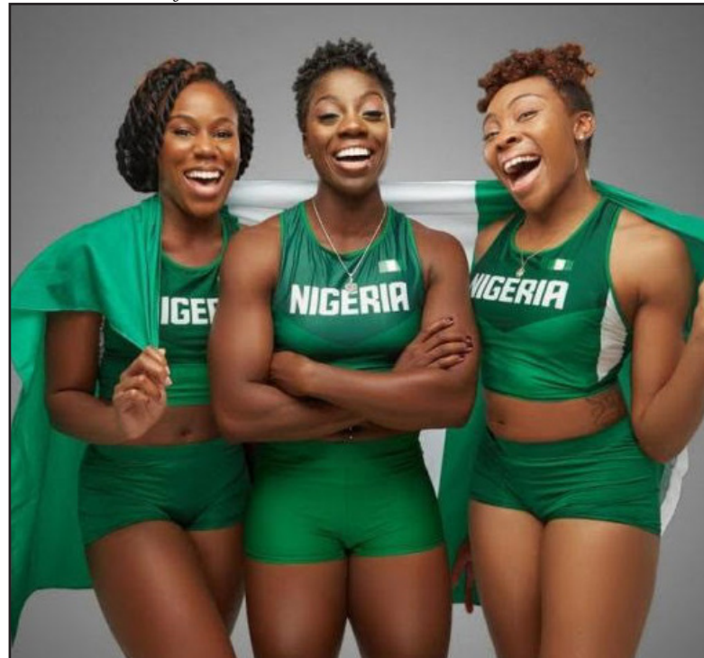
In their uniforms they were able to afford through their GoFundMe Campaign, the athletes represent Nigeria with visible pride.