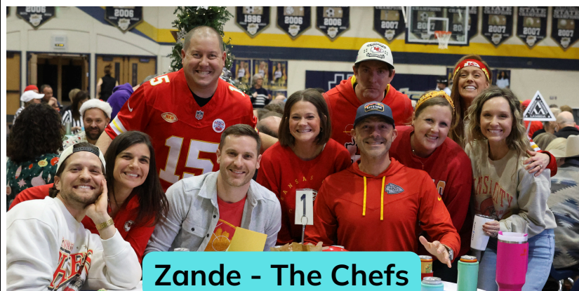
Zande - The Chefs