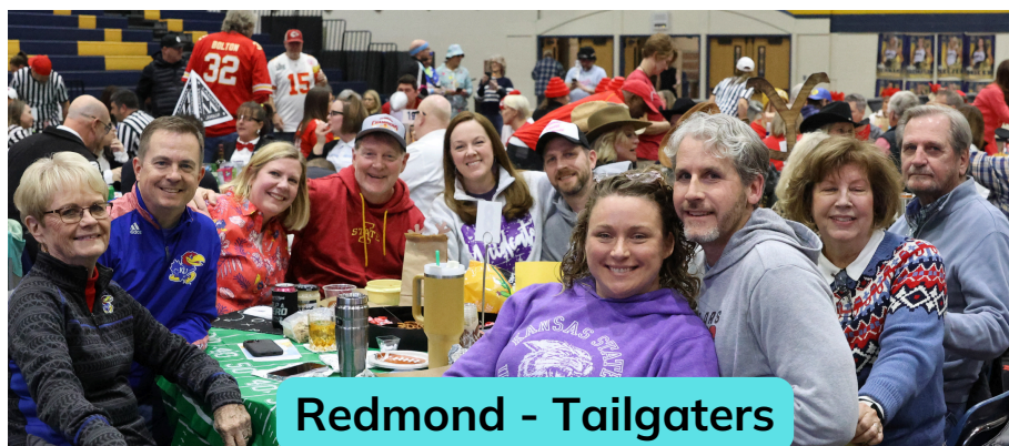
Redmond - Tailgaters

What a night for Saint Thomas Aquinas! We had over 50 Alumni participants. We had Alumni from 1987 to 2021! It is so special to see the wide range of Alumni coming together and being able to share in the memories of Saint Thomas Aquinas while make new ones on their new adventure in life!