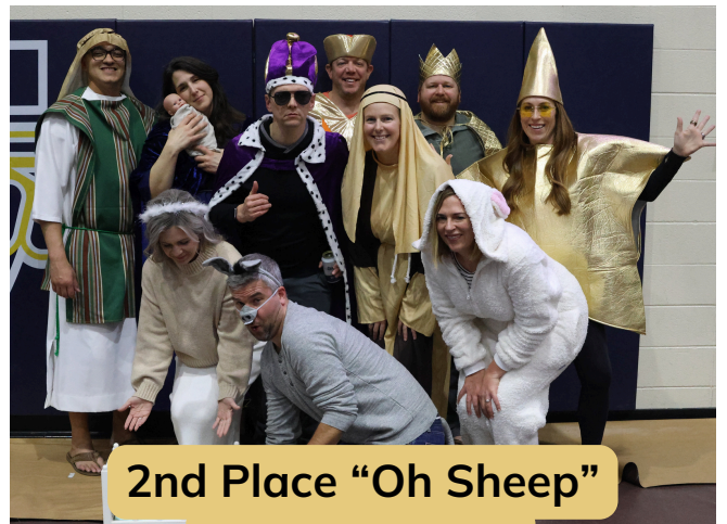
2nd Place "Oh Sheep" Flournoy Crew

The Saints Trivia Challenge was a fantastic night with over 50 Alumni participants! The money raised for the event goes to our Saints Community Fund which helps our teachers and student fulfill resource needs. We greatly appreciate the trivia goers that made the night a fun memory and we look forward to next year's event!