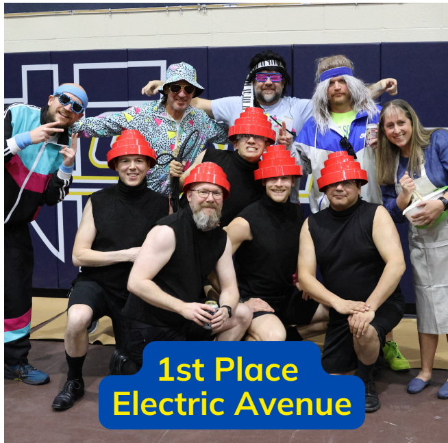
1st Place Electric Avenue

THE OFFICIAL NEWSLETTER OF SAINT THOMAS AQUINAS