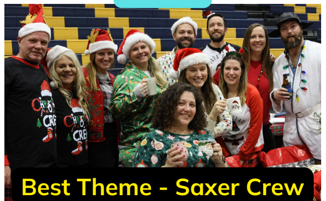
Best Theme - Saxer Crew Presents Under Pressure