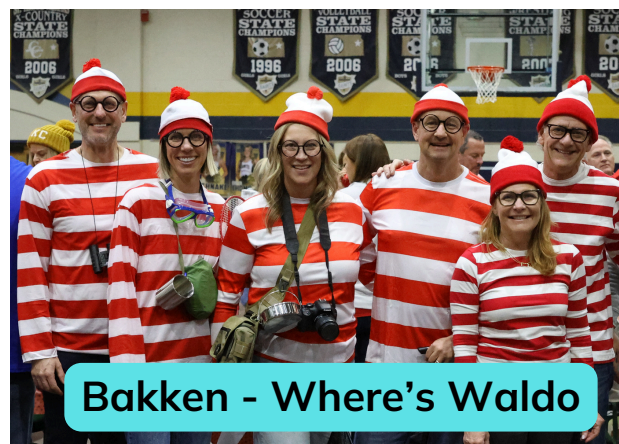
Bakken - Where's Waldo