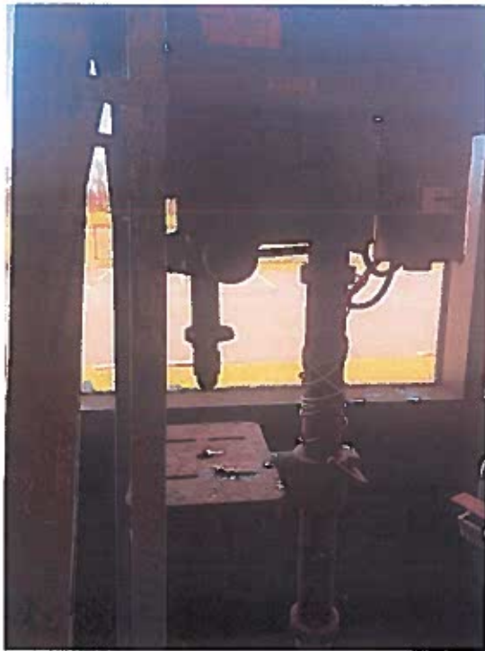
AB Drill Press 1689