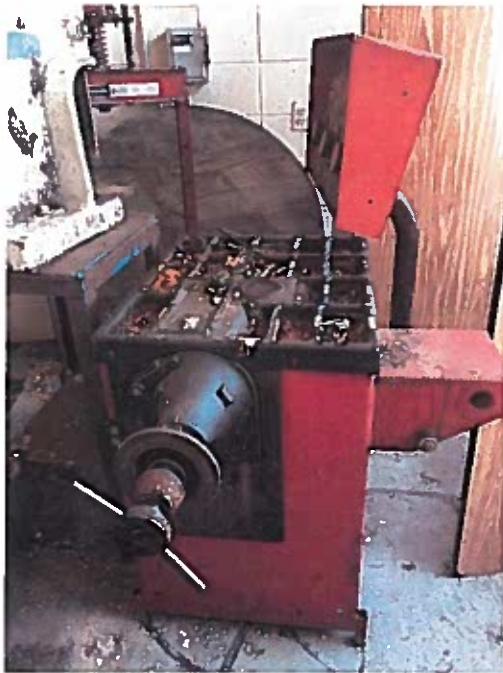
Coats model 1001-116 Wheel balancer