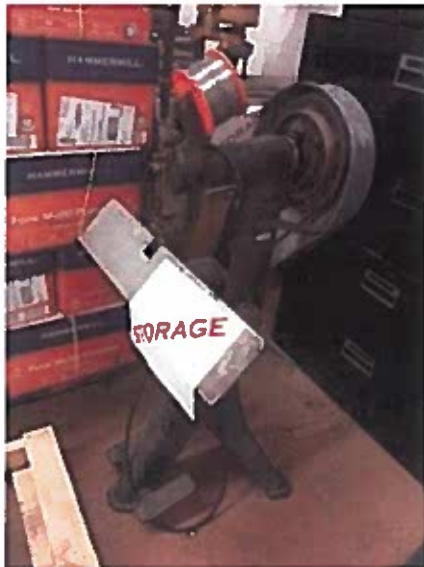
Mechanical Stapler Hempstead Asset Tag 63412