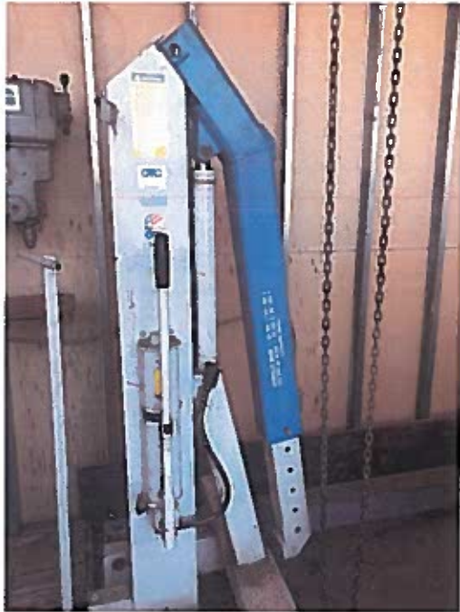
OTC Hydraulic lift