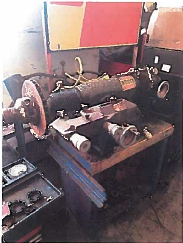
Ammco 6900 Twin Facing Tool Break Lath