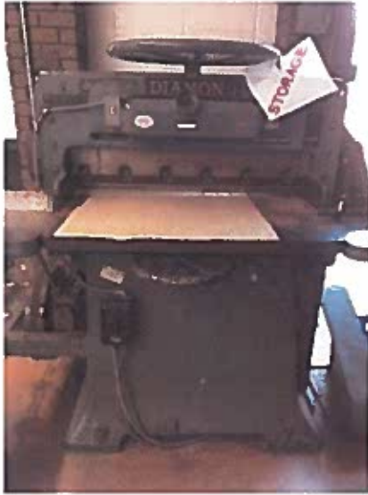
Mechanical Paper Cutter Hempstead Asset Tag 100490