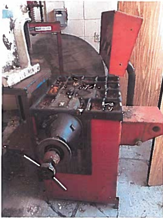
Coats 40-40 tire changer