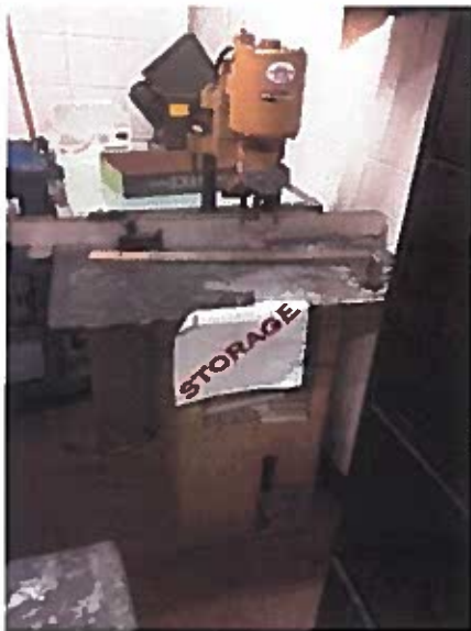
Book Hole Drill