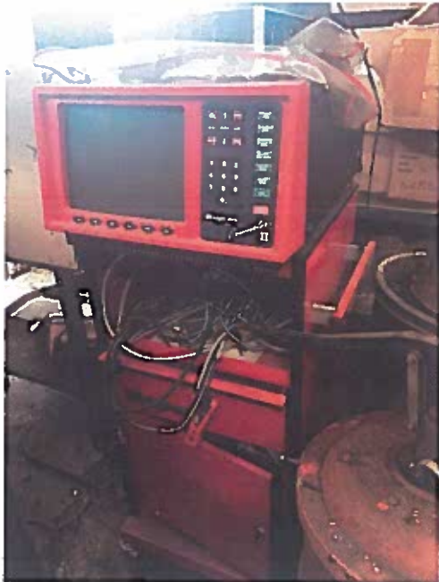
Snap On Counselor II Diagnostic Tool