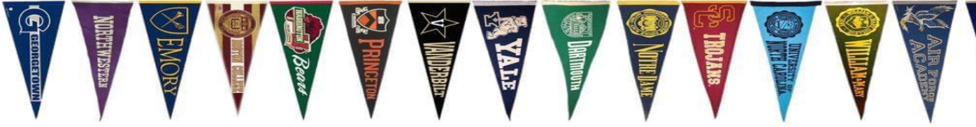
Chico State University