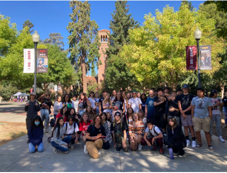
University of Oregon