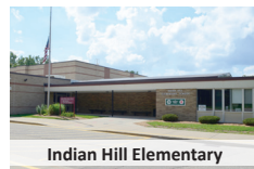
Indian Hill Elementary