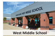
West Middle School