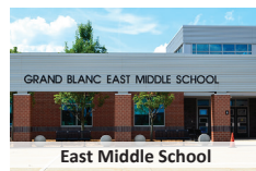
East Middle School