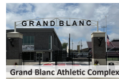
Grand Blanc Athletic Complex