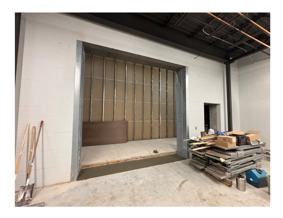
LAST OVERHEAD DOOR OPENING PUNCHED IN GYM ADD.