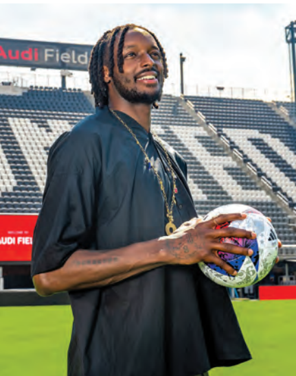
Jerami Grant '12 has joined the D.C. United ownership group as an investor.