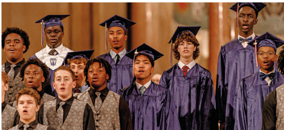
The Voices of DeMatha sang beautifully during graduation.