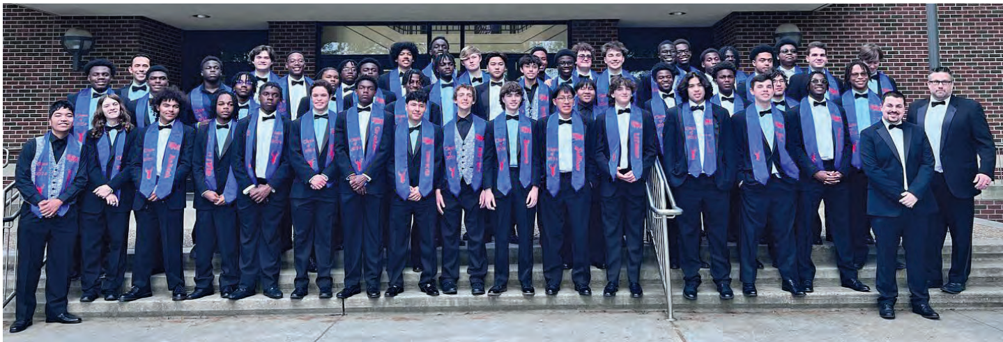
Seniors closed out their DeMatha musical careers with several excellent and superior ratings at the Festival of Music event in April. They are shown here outside of the L. Douglas Wilder Performing Arts Center on the campus of Norfolk (Va.) State University.

DeMatha musicians had several stellar performances in April at the Festivals of Music event in Virginia Beach, Va. Here are the awards we won and ratings we received: