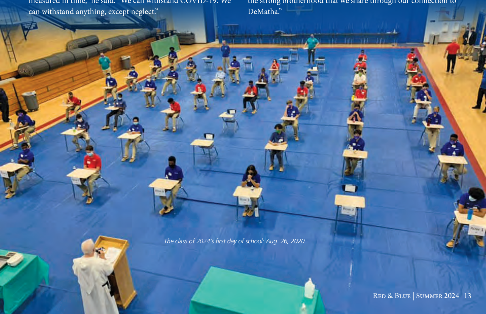
The class of 2024's first day of school: Aug. 26, 2020.