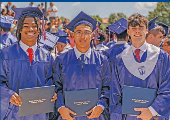
Graduates celebrate outside the Basilica of the National Shrine of the Immaculate Conception.

“Only one of us has had the privilege of speaking at graduation, and for that I am honored.”