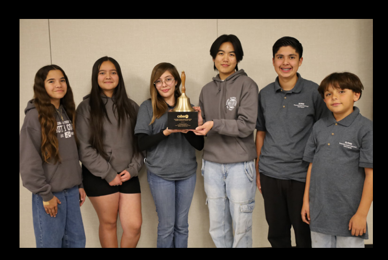
Hacienda La Puente Unified Youth Court students celebrate earning a 2024 California School Board Association Golden Bell Award during a program event on December 10.

A Hacienda La Puente Unified restorative justice youth court program that promotes an innovative, proactive approach to reducing out-of-school suspensions has been recognized by the California School Boards Association (CSBA) with its prestigious Golden Bell Award.