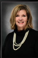
Jeanne Butler Rata School