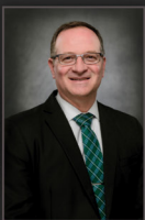
Michael Allen Roosevelt High School