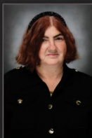
Otilia Sanchez Williams Elementary School