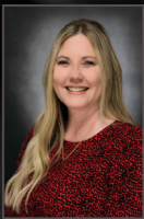
Meredith Farnsworth Lawless Elementary School