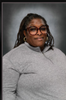
Camille Myles Adult Transition Program