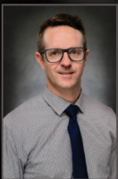
Douglas Wilkins Baird Middle School

"It's that culturally proficient lens that will add to our students' success and outcomes and in addition, to customer service."