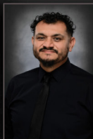
Jonathan Hinojosa Farber Educational Campus