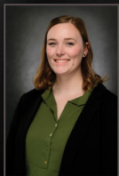
Amber Donat Phoenix Secondary Academy