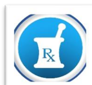
Pharmacy Tech Certificate