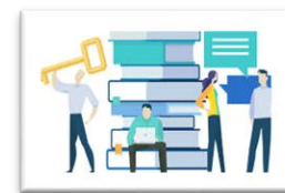
General Studies Transfer Certificate

Visit www.ccboe.com/cte or speak to your school counselor for more information.