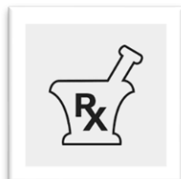
AHP: Pharmacy Technician