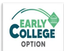
Early College Option

Charles County Public Schools has partnered with the College of Southern Maryland (CSM) to offer Early College Options. Click on the icons below to learn more about how to earn college credit while still in high school. Click the images to learn more.