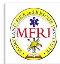
Fire Science: Maryland Fire & Rescue Institute (MFRI)

Below are pathways that include Work-Based Learning opportunities. Click the images to learn more.