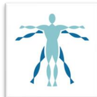
AHP: Physical Rehabilitation