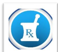
Pharmacy Tech Certificate