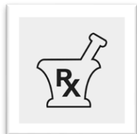
AHP: Pharmacy Technician