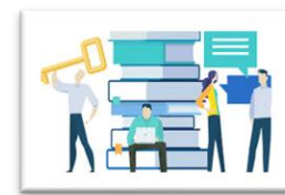
General Studies Transfer Certificate

Visit www.ccboe.com/cte or speak to your school counselor for more information.