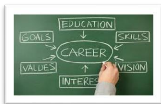
Career Research and Development

Below are pathways that include Work-Based Learning opportunities. Click the images to learn more.