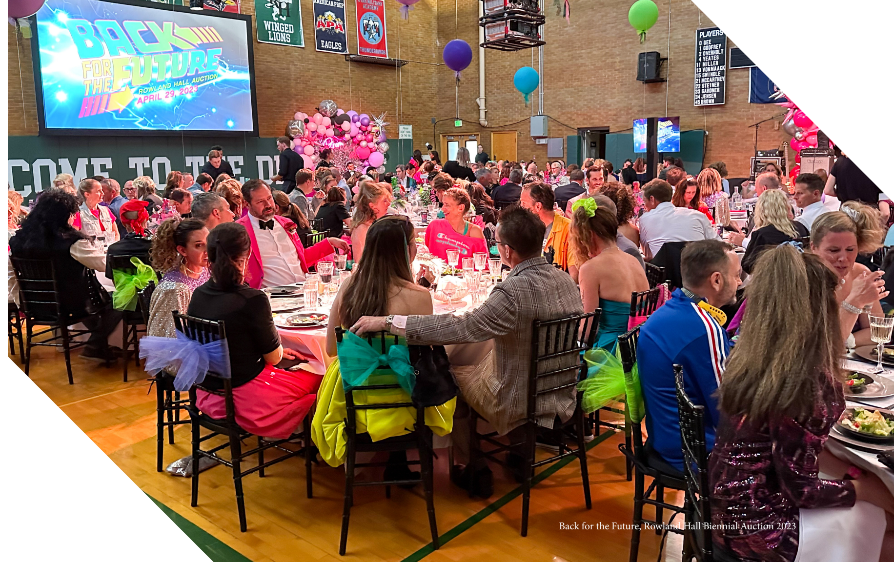
Back for the Future, Rowland Hall Biennial Auction 2023