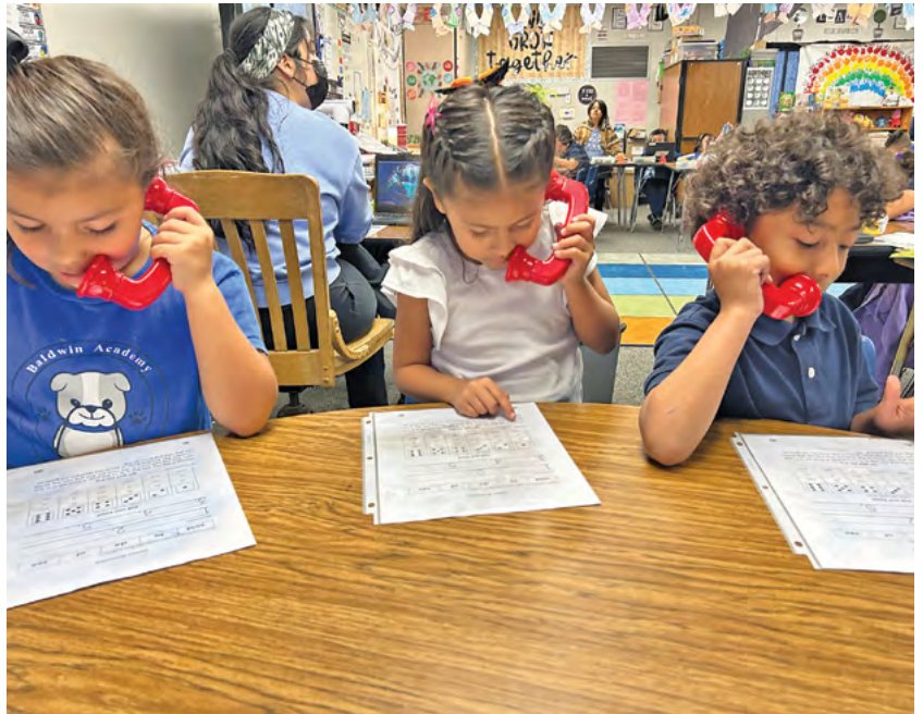
Baldwin Academy students building literacy skills.

Baldwin Academy's achievements reflect its dedication to excellence, equity, and community involvement.