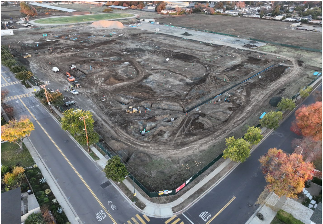
View above the intersection of Teal Drive and Dunford Way, December 4, 2024.