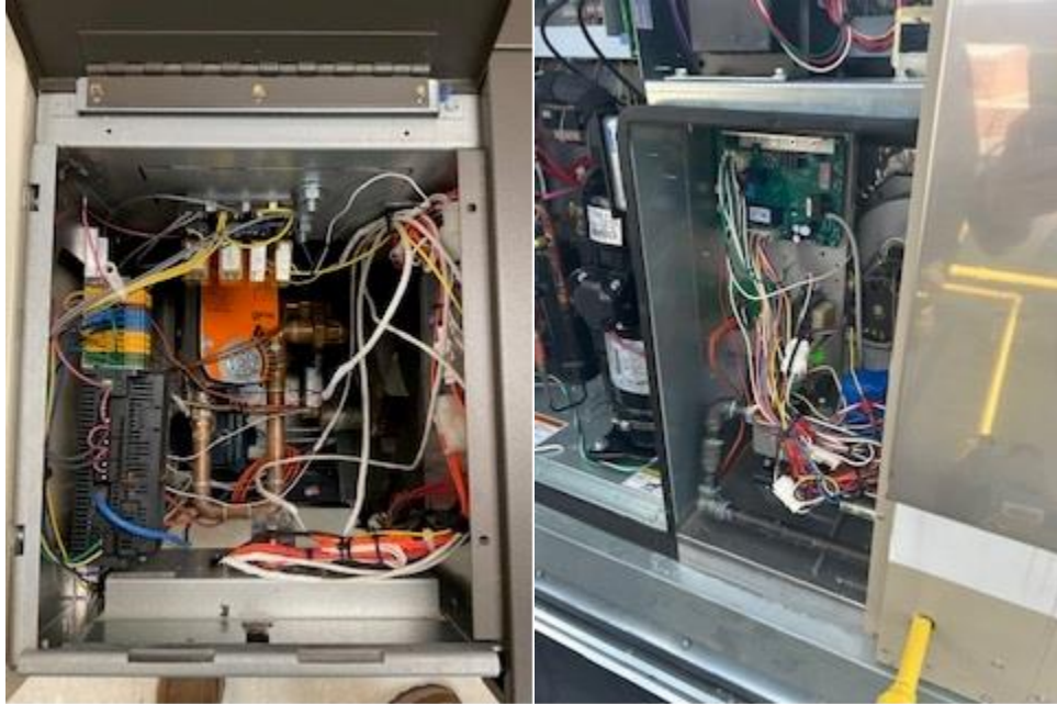
Trouble shooting ERU 11 Serving Science Room 162