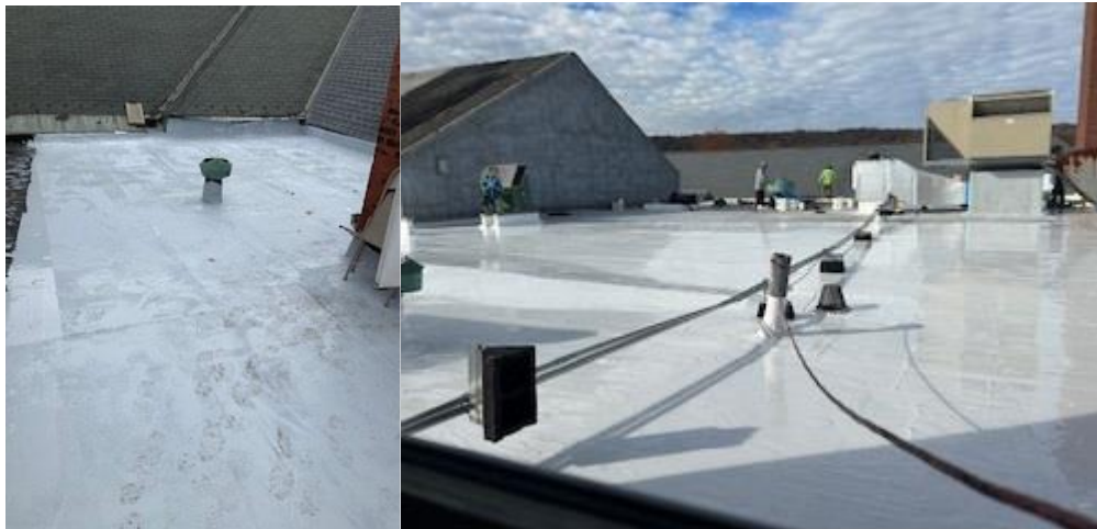
Auditorium Rooftop Coating- awaiting weather and temperatures for final 2 nd Coat