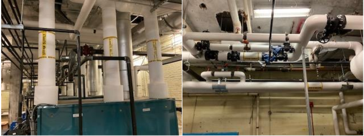
Boiler Room- Insulation & Labeling