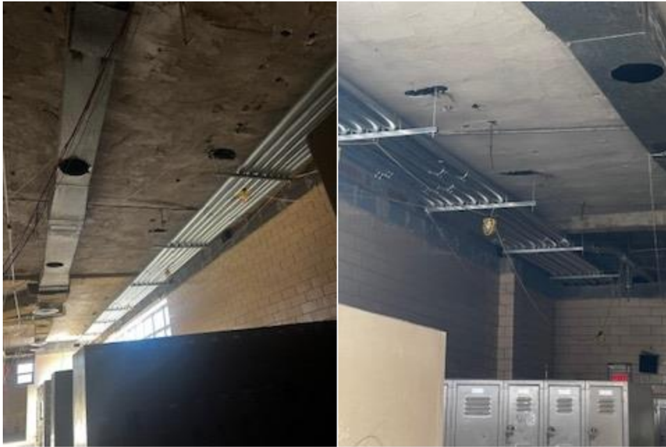
SOMS Electrical Upgrade- conduit runs.