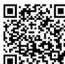
City of Bedford Heights