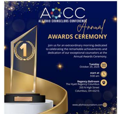
The AWESOME AWARD!