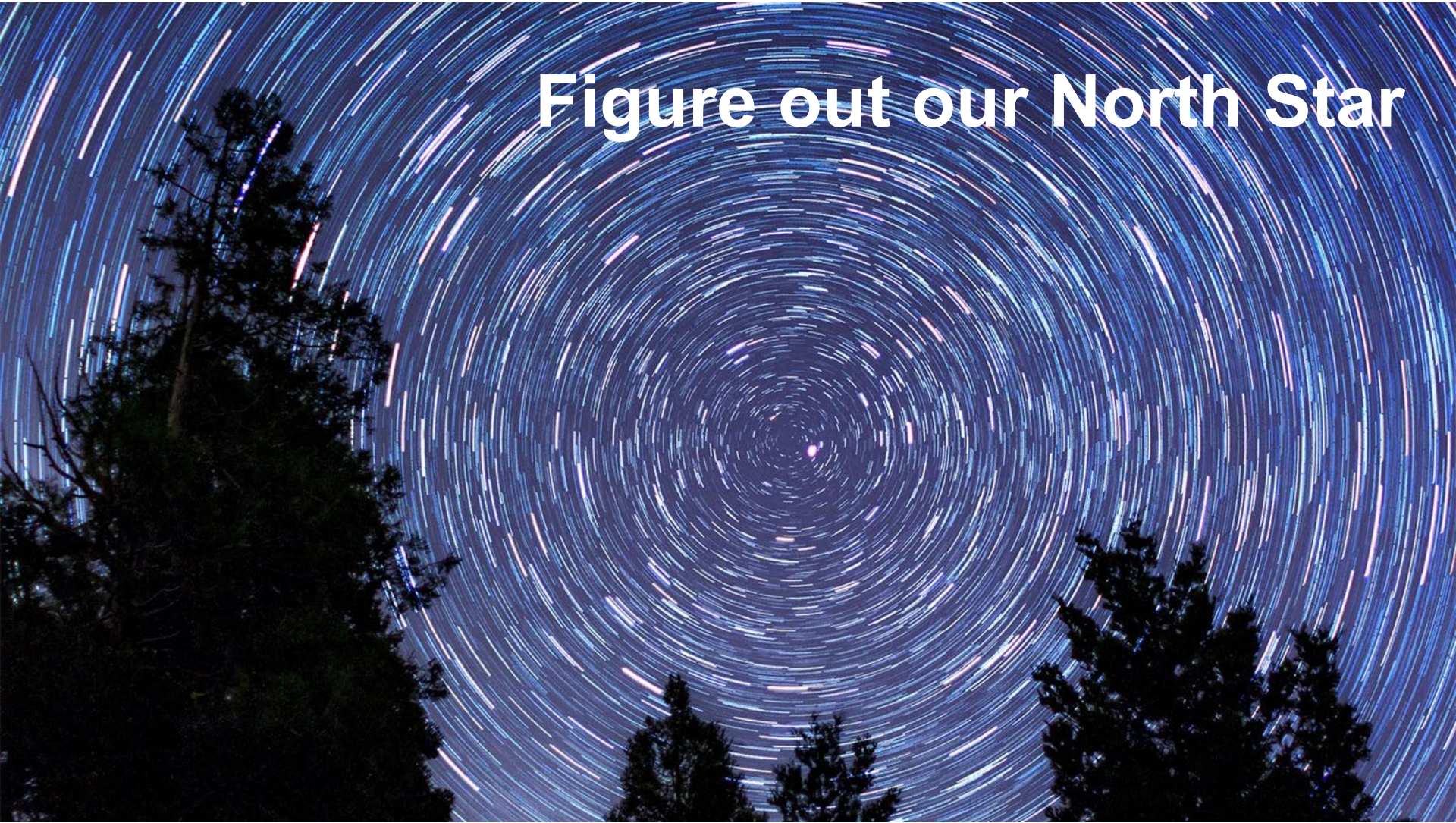
Figure out our North Star