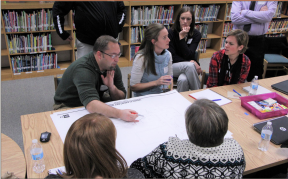
Staff User Group Meeting

All images are from Ixonia Elementary School renovation.