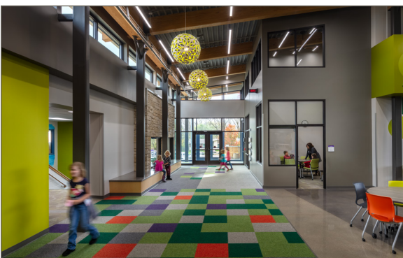
Final Interior Image