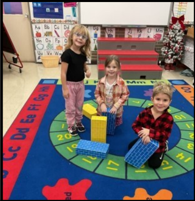
The preschoolers have been enjoying a variety of activities this winter.