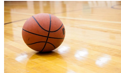
Rise and Shine Basketball, Fun In the Gym, Sports and Games