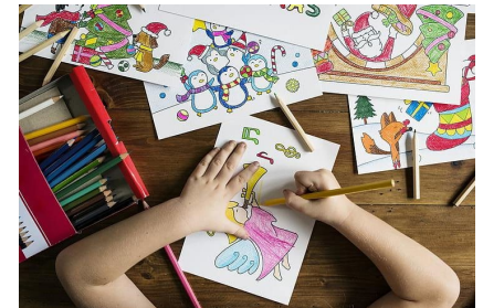
Art Kidcreate Studio