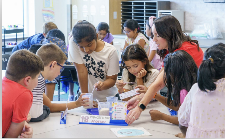
Table Talk & Open Discussion with Q&A