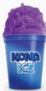
COLOR CHANGING $6.00 $3 refills