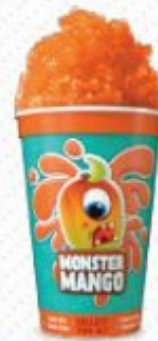
KOLLECTABLE $7.00 $3 refills

ENJOY KONA ICE ON YOUR HALF DAY OF SCHOOL