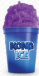
COLOR CHANGING $6.00 $3 refills