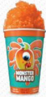
KOLLECTABLE $7.00 $3 refills

ENJOY KONA ICE ON YOUR HALF DAY OF SCHOOL