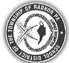
RTSD ORGANIZATIONAL CHART