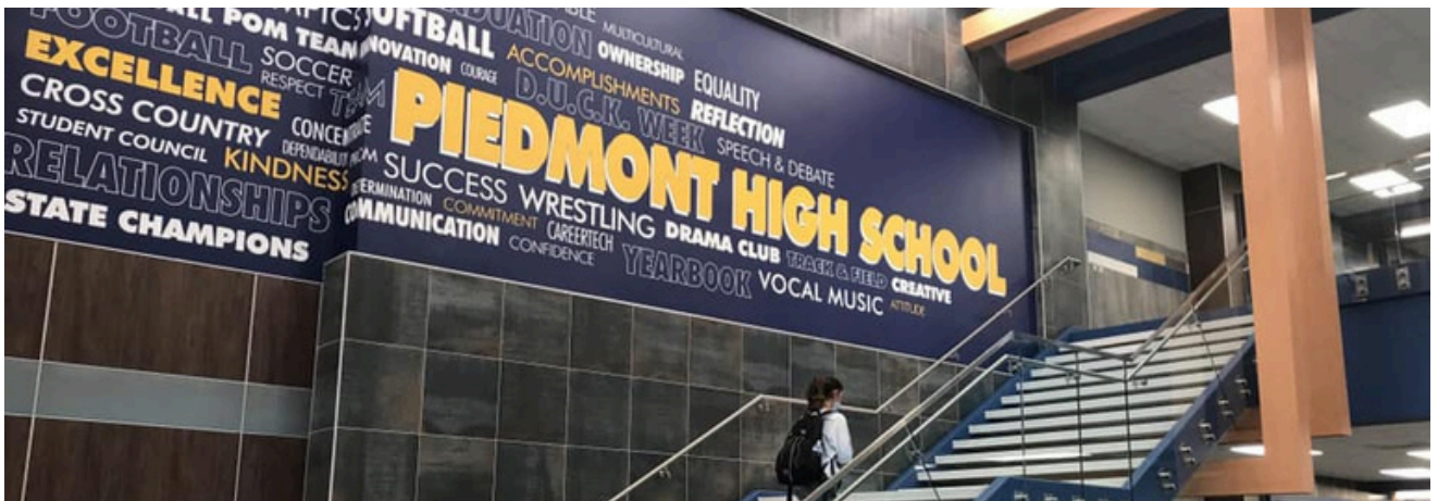
Piedmont High School