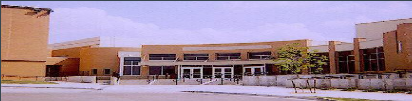
Park Hill High School