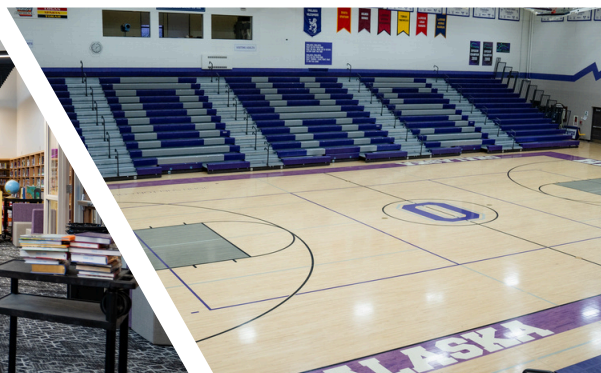
High School Fieldhouse