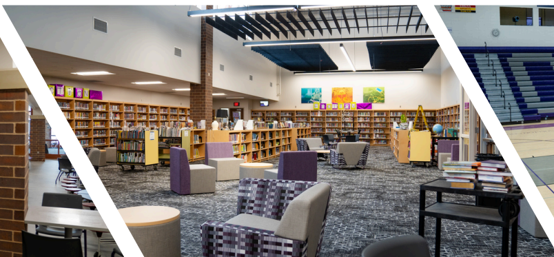
Middle School Library