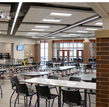
Middle School Commons and Entrance

The middle and high school building projects continue to progress. If you have ridden down Quincy or Wilson Streets, you can see noticeable changes on a weekly basis. At OMS, the main entrance, administrative offices, and new gymnasium are now complete. Classroom area build outs and interior remodeling continues. The current areas of focus at OHS are the tech ed and music learning spaces. The completion target date for both projects is September 2025. We are forever grateful for the community support of our schools. You have made a long-term investment in the learning of our students.