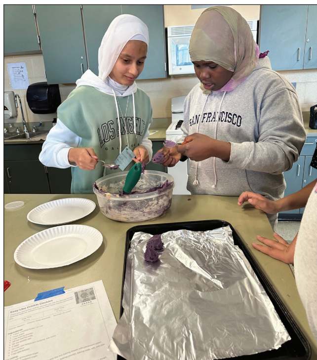
International Culture Club members have fun making Filipino cookies at a recent meeting.