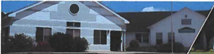
EDDINGTON ELEMENTARY SCHOOL