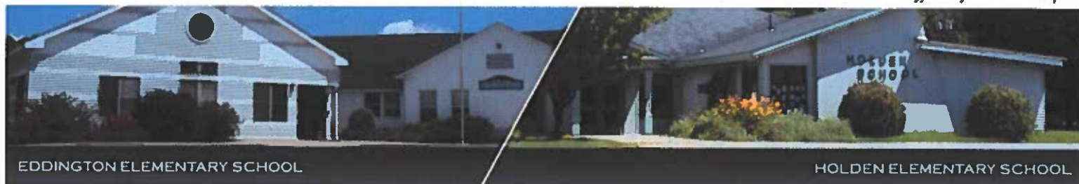
EDDINGTON ELEMENTARY SCHOOL