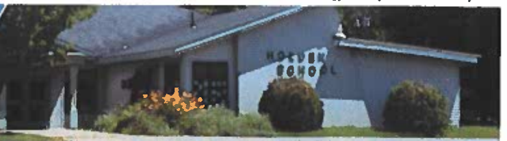
HOLDEN ELEMENTARY SCHOOL

440 Main Road | Eddington, ME 04428 | P: 207-843-6010 | F: 207-843-4317