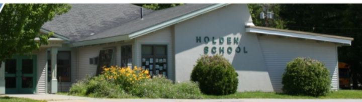
HOLDEN ELEMENTARY SCHOOL

440 Main Road | Eddington, ME 04428 | P: 207-843-6010 | F: 207-843-4317