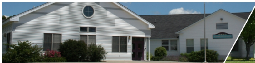
EDDINGTON ELEMENTARY SCHOOL