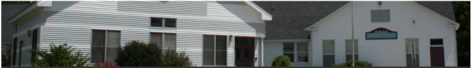
EDDINGTON ELEMENTARY SCHOOL