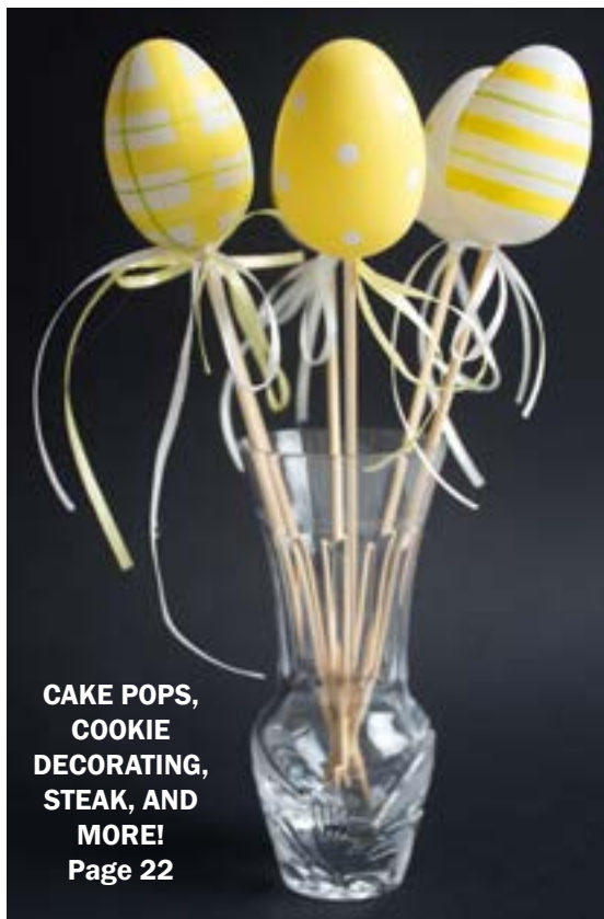
CAKE POPS, COOKIE DECORATING, STEAK, AND MORE! Page 22