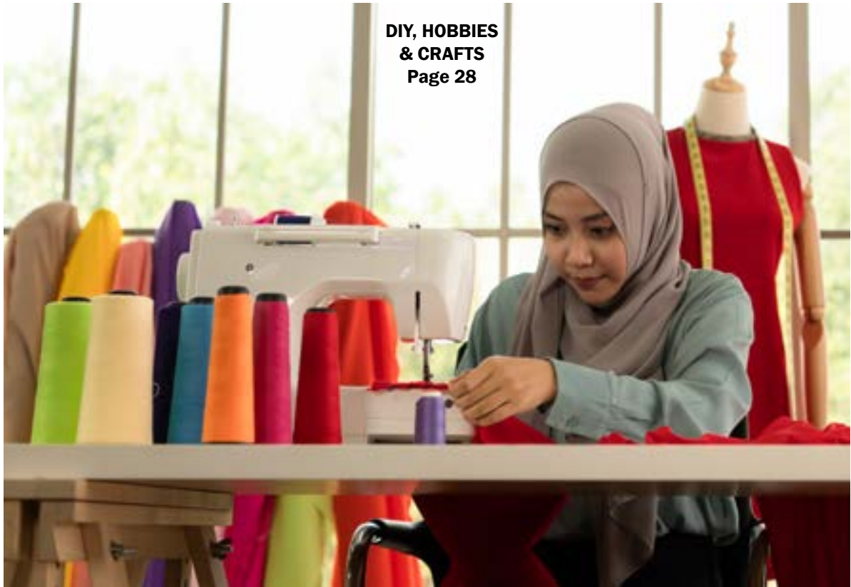
DIY, HOBBIES & CRAFTS Page 28