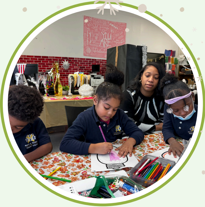
Scholars completing “I light up this room” activity during SEL group