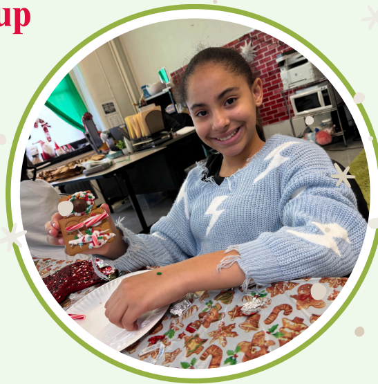
Scholars completing ginger bread cookie ice breaker during SEL group