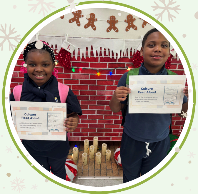
Scholars identifying their cultural traditions and values during SEL group