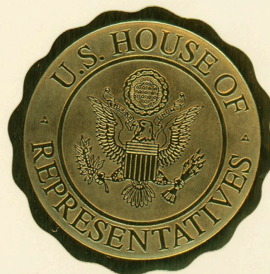
Thomas H. Kean Member of Congress

The past 100 years have served as a reflection of the vibrant legacy that will continue to inspire and shape future generations. The Oak Knoll School of the Holy Child has stood as a testament to a century's worth of educational innovation, resilience, and dedication. May the school's next 100 years be filled with as much success as the past 100 years.