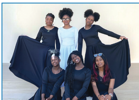
Student Dance Group Martin Luther King Jr. Middle School