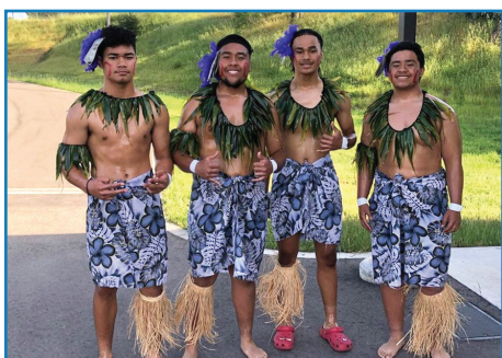
The Polynesian Club Hayward High School