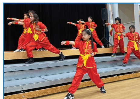
Husky Martial Arts Club Stonebrae Elementary School