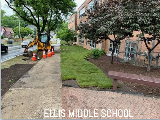
ELLIS MIDDLE SCHOOL Landscape Update