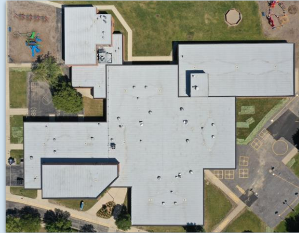
LORDS PARK ELEMENTARY SCHOOL