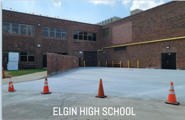
ELGIN HIGH SCHOOL Loading Dock Repairs