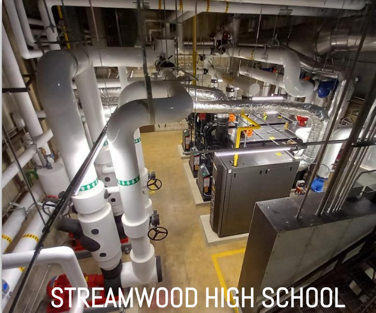
STREAMWOOD HIGH SCHOOL

Boiler, Pumps and Generator Replacement (Phase 1)