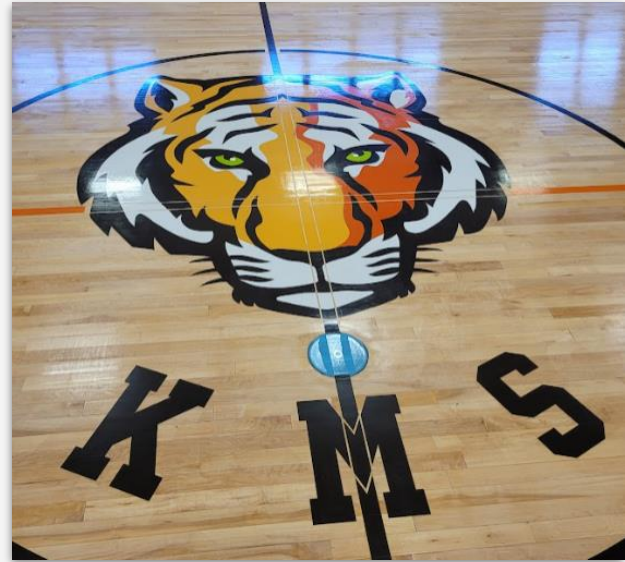
KIMBALL MIDDLE SCHOOL