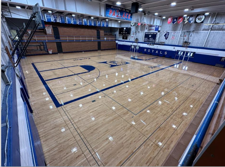
LARKIN HIGH SCHOOL