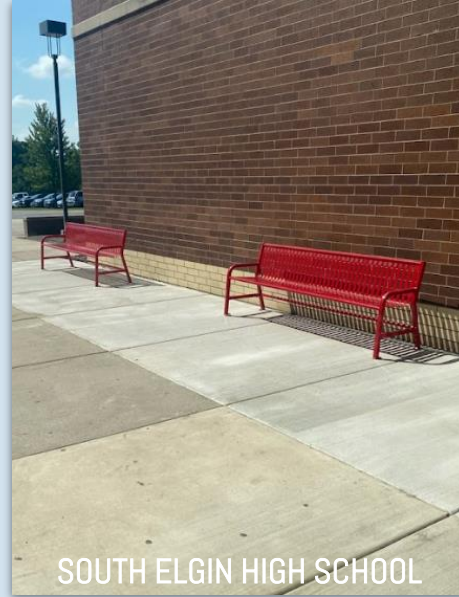
SOUTH ELGIN HIGH SCHOOL Concrete Work & Bench Installation