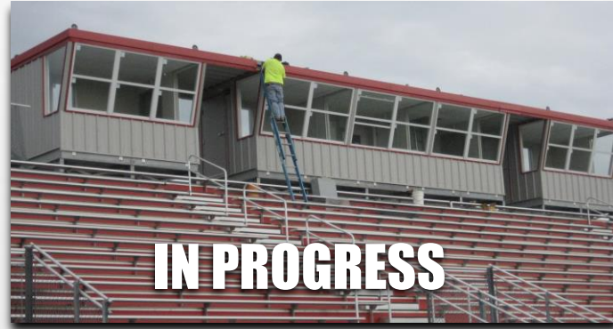
South Elgin High School Pressbox, Lighting and Track Repair