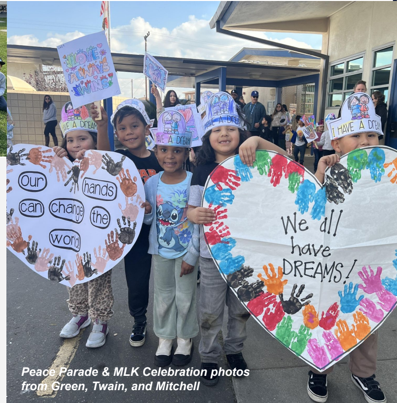
Peace Parade & MLK Celebration photos from Green, Twain, and Mitchell